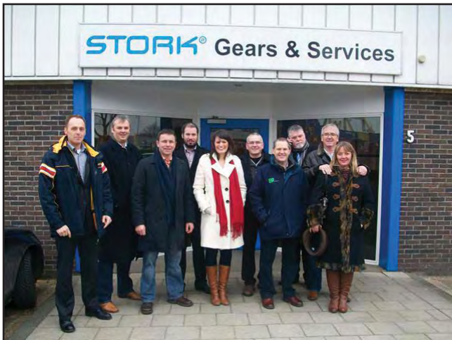
Delegates from the Global Wind Alliance at their recent meeting in the Netherlands.

In the current environment of rapid global growth in wind energy, the Global Wind Alliance is ideally positioned to support the rising expectations of the maturing wind farm owners.