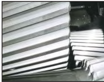
Cleanliness of gears which have been running for over two years with Castrol Optigear Synthetic X.

Castrol Optigear Synthetic X can be confidently used in wind turbine gearboxes which have left their warranty period and where it was not the first-fill oil. Switching to Castrol Optigear Synthetic X for service-fill has been shown to completely eliminate